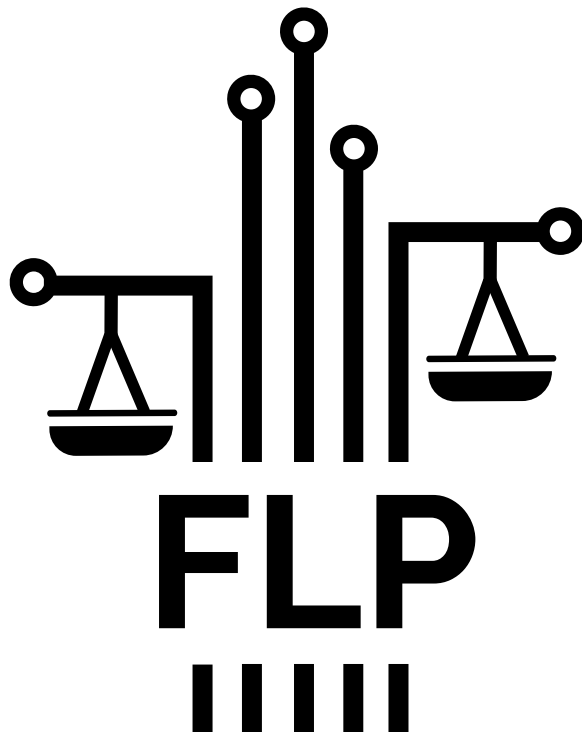
Version with acronym